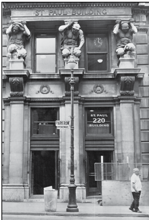
Facade of St. Paul Building with The Races of Man

located between the building and the statues, and two geysers of water would rise from it. Indianapolis artist Elmer Taflinger submitted drawings of the site, and the city estimated that it would spend $25,000 on the installation. The description of plans stated that funds were available for the erection of the structure and that Taflinger would supervise the entire installation.