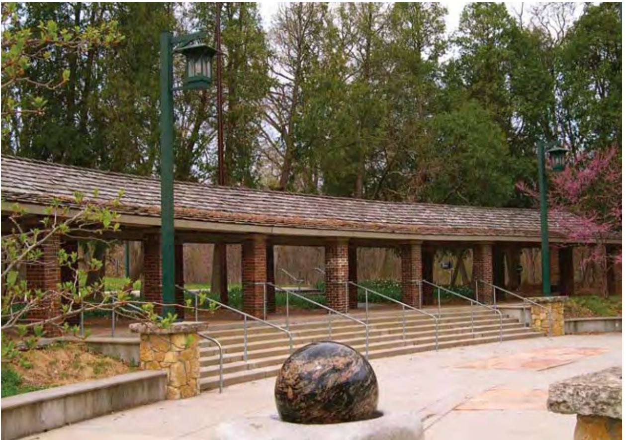
The Pergola at Holliday Park