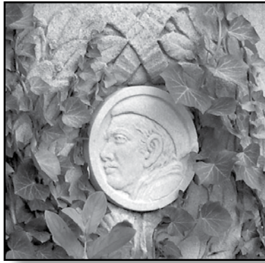
Taflinger Medallion in the Ruins

positioned on either side of the Ruins. Only two remain in 2007, the result of weather, time and vandalism. Two capitals from columns originally at Broadway Christian Church and a stone table once part of an altar at St. Paul's Church were later included.