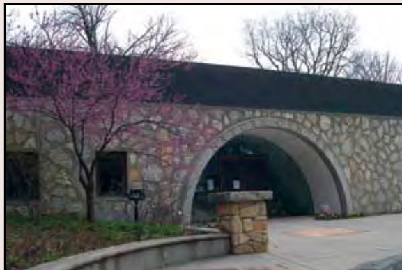
Holliday Park Nature Center