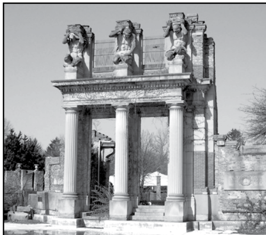
The Races of Man in the park