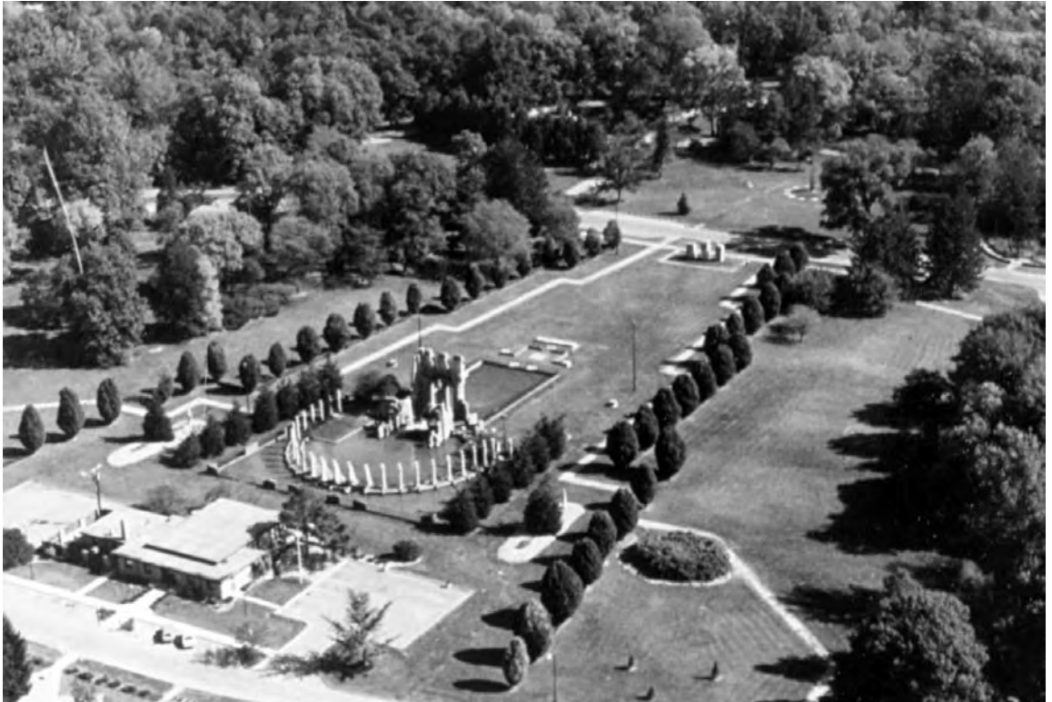
Incomplete Constitutional Mall about 1977