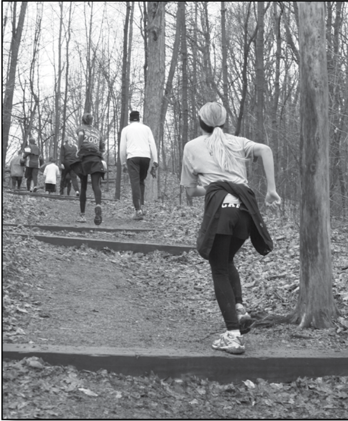
Holliday Park Trail Run